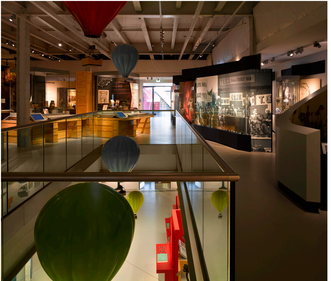
Project M Shed Design Event Communications