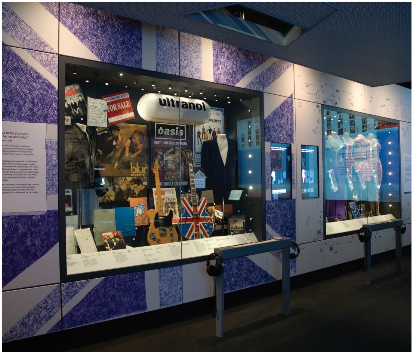
Project British Museum Experience Design Land Design Studios