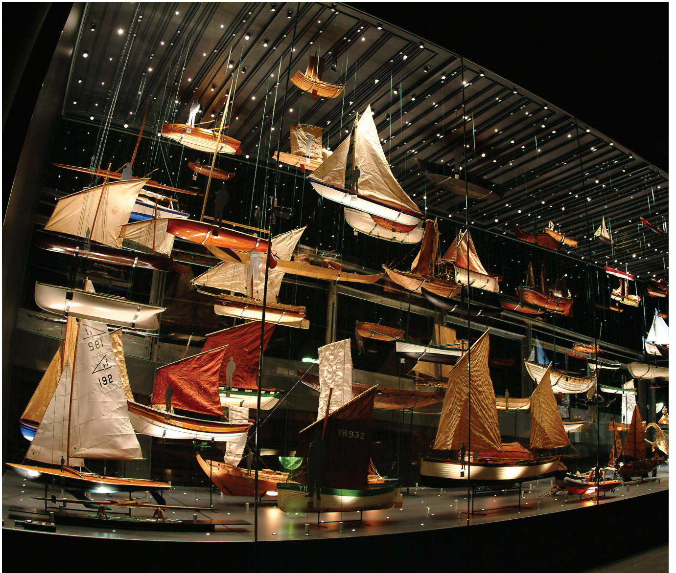
Project National Maritime Museum, Falmouth Design Land Design Studio