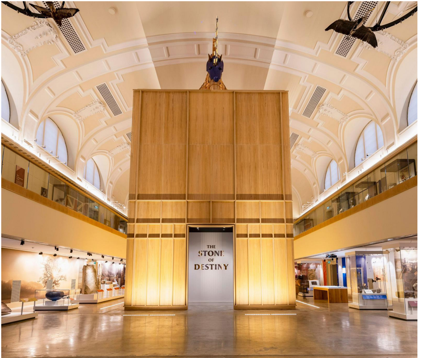
Project Perth Museum Design Metaphor