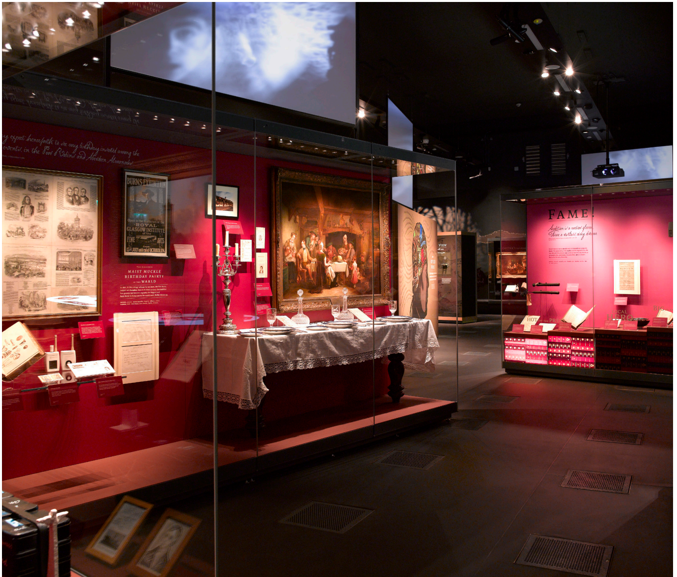
Project Robert Burns Birthplace Museum Design Event Communications