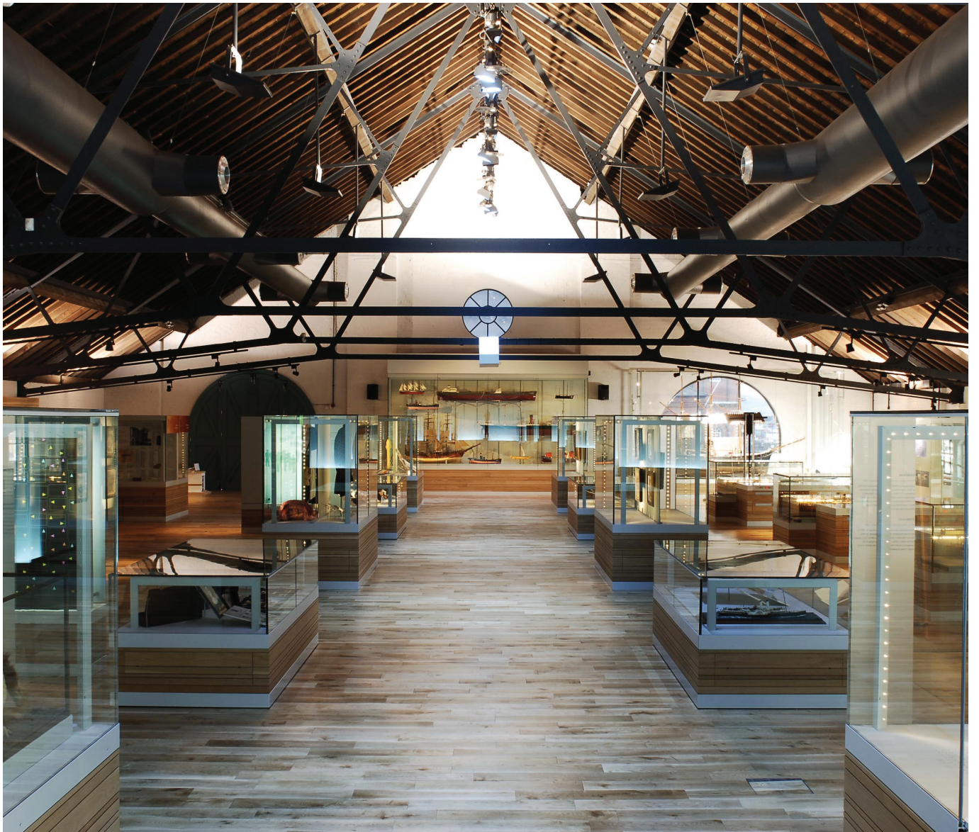
Project National Maritime Museum, Swansea Design Land Design Studio