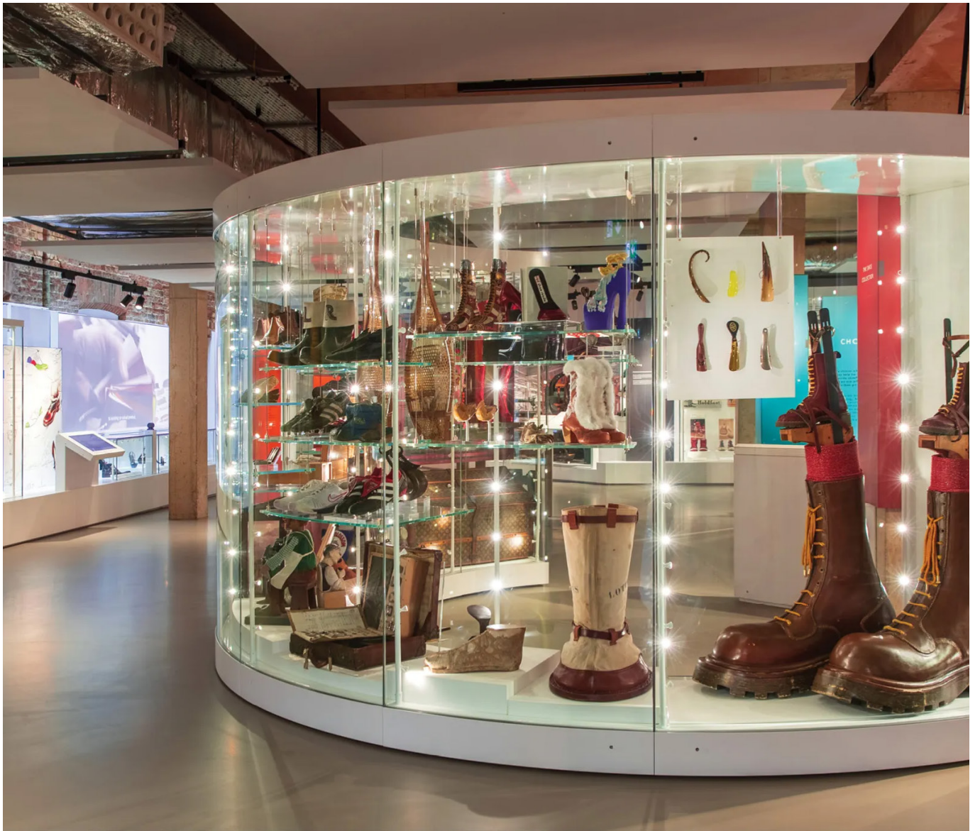
Project Northampton Museum & Art Gallery Design Design Creative Goods