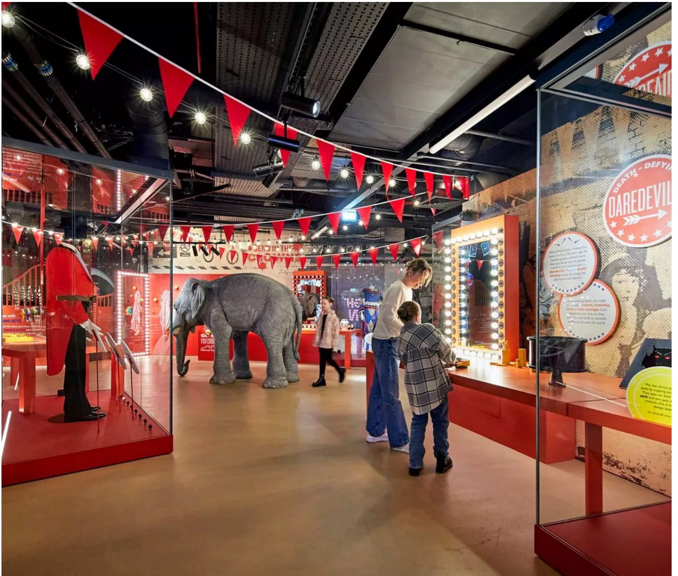
Project Showtown Entertainment Museum Design Casson Mann