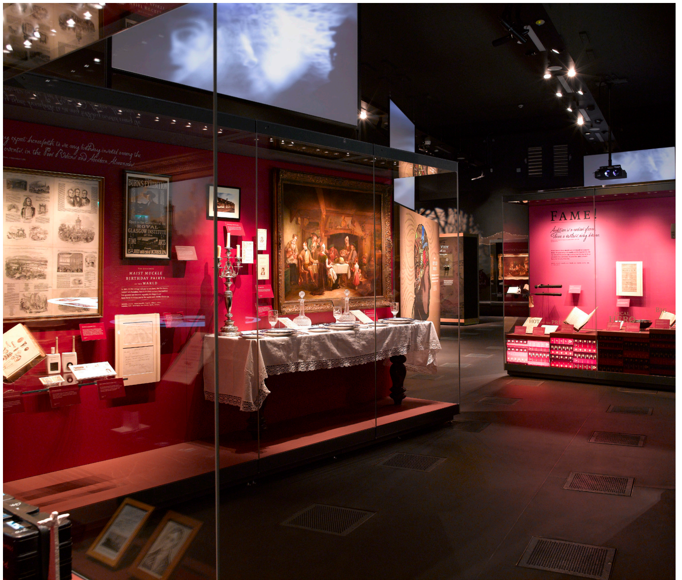
Project Robert Burns Birthplace Museum Design Event Communications