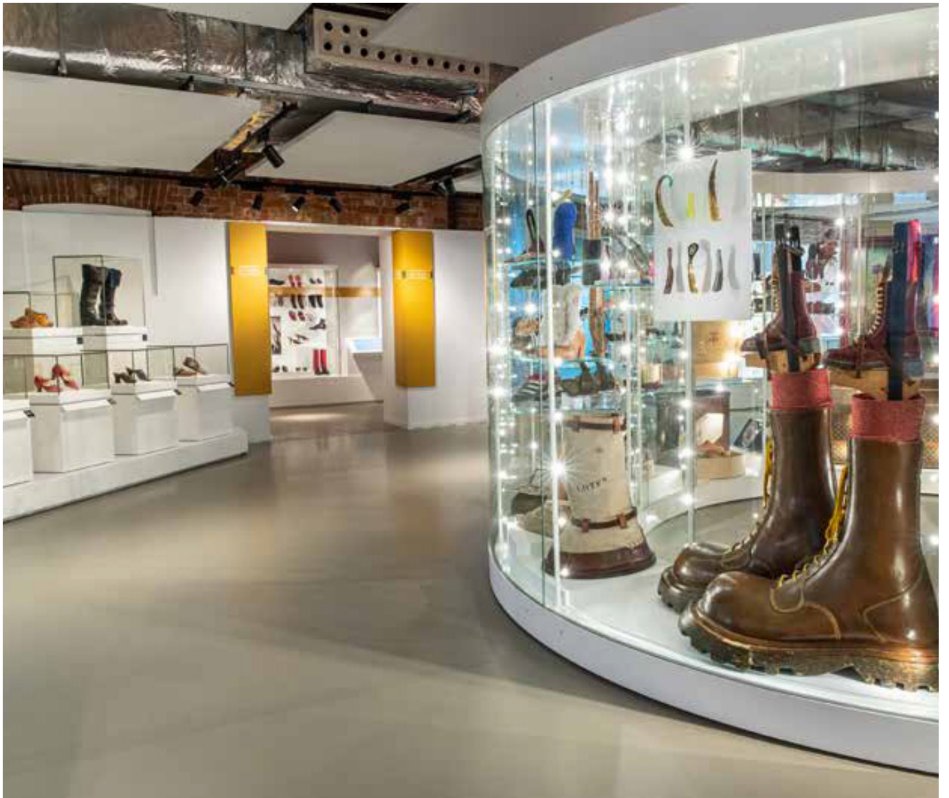
Project Northampton Museum & Art Gallery Design Design Creative Goods