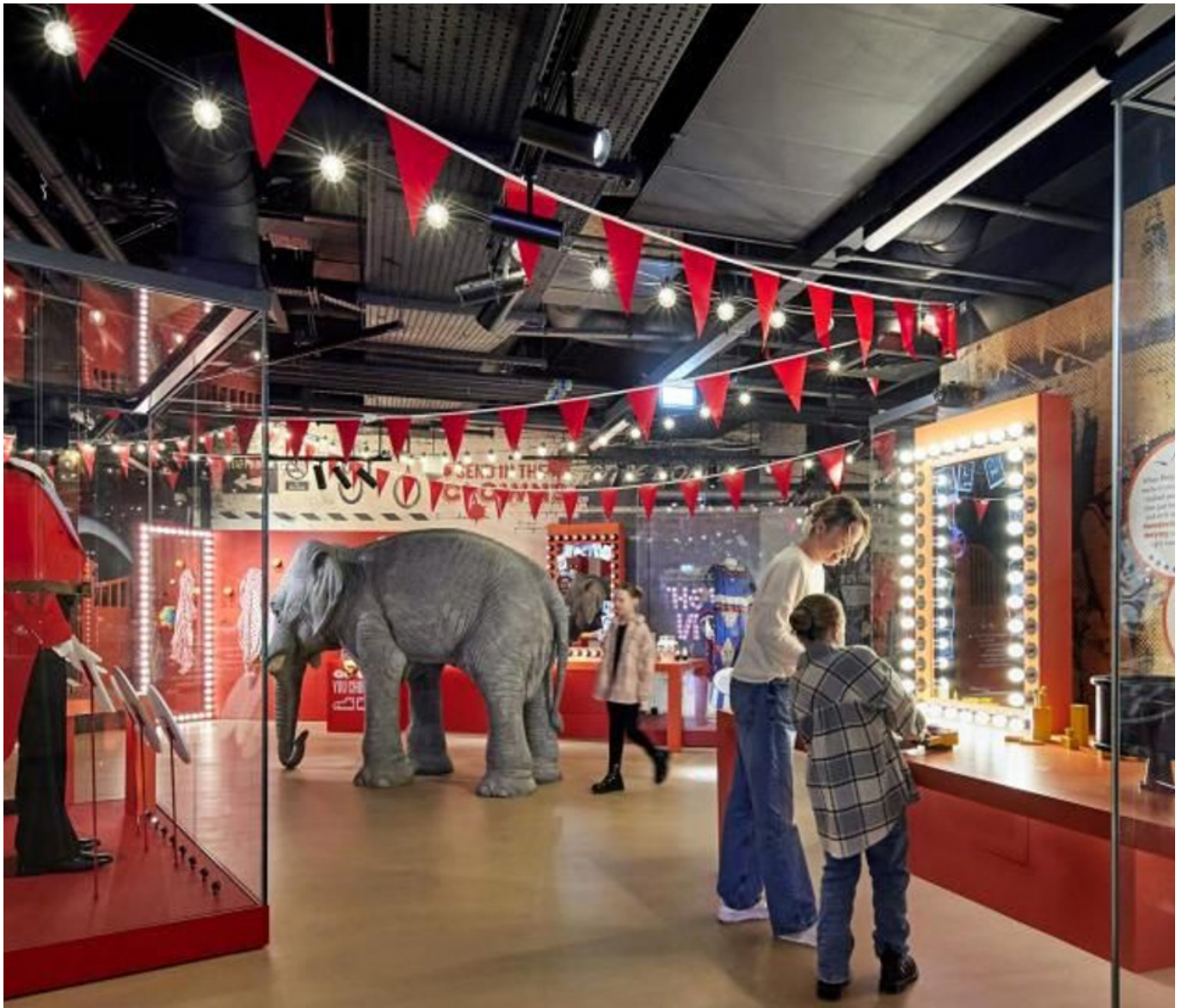
Project Showtown Entertainment Museum Design Casson Mann