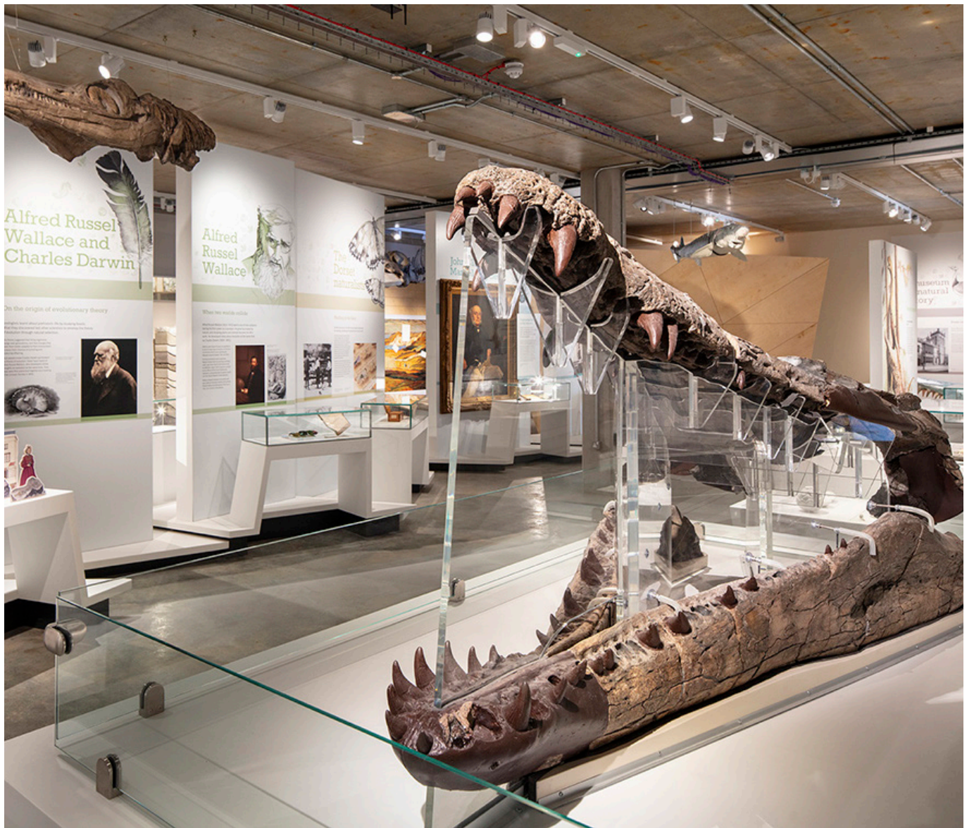
Project Dorset Museum Design Real Studios