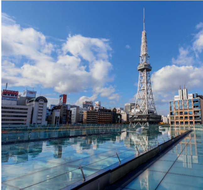
Oasis 21, Japan: A floating glass floor consisting of 1089 structural panels for a glass-bottomed lake with a walk-on glass perimeter

We will provide high quality glass that gives you the edge in your market; whether you design or safeguard buildings, or manufacture military and commercial vehicles. Whatever the project, you imagine and we deliver.