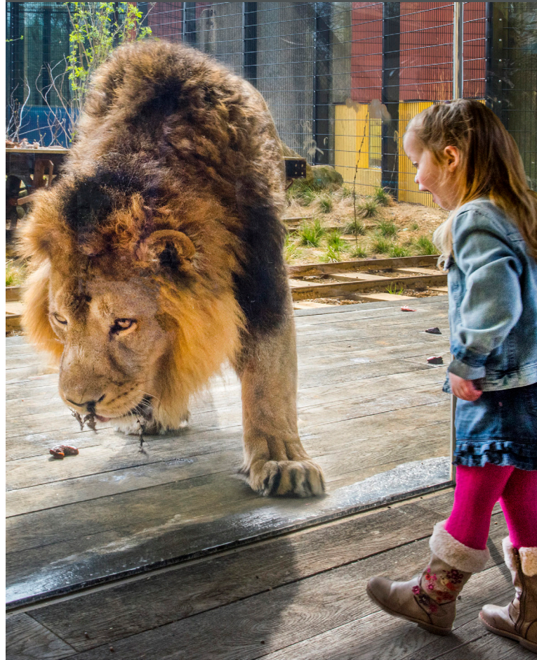
London Zoo, 'Land of the lions': An anti-reflective glass of less than 1% reflection and 97% light transmission, uniquely manufactured to high levels of safety and security.

As one of the oldest and most experienced glass processors in the UK, Dellner Glass Solutions has the technical expertise to produce glass that performs multiple functions. Our advanced production and testing facilities, paired with our talented and experienced staff ensure we are able to excel in a highly technical, competitive supply chain.