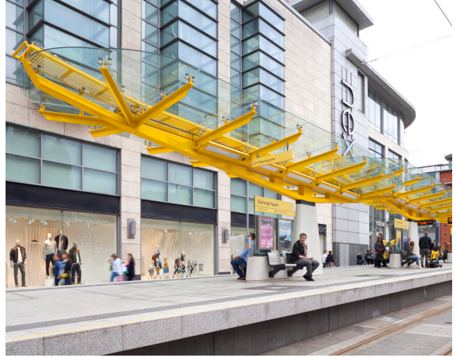
Exchange Square: Dellner Glass Solutions supplied toughened, laminated, shaped glass canopies for the tram stations at Manchester's Exchange Square.

With two specialist manufacturing units, and over 80 years experience, we produce complex, high performance product assemblies across transport, architectural, security and military markets.